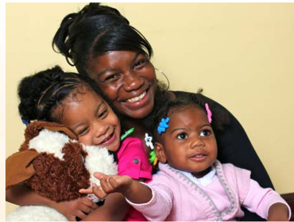
A mother and her children who have overcome barriers through WomenRising's programs.

counseling, crisis intervention, workforce development and job placement, shelter for victims of domestic violence, outreach, advocacy and referrals. WomenRising's broad range of programs and services address emergency needs, long-term recovery and everything in between. Over the past year, WomenRising assisted over 10,000 women, children, and families.