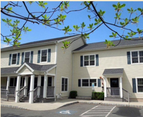
The Crawford House.