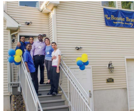
Residents outside of the Bound Brook Transitional Living Group Home.