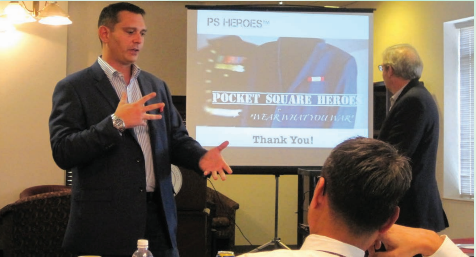
VLV student presenting his marketing plan for a clothing accessory business for returned military-service members.