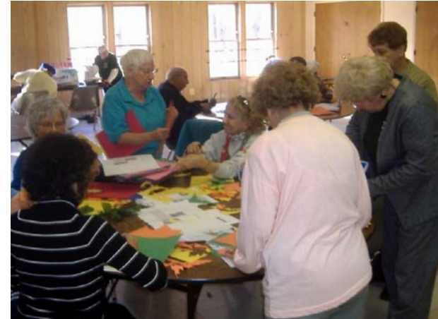
Senior campers socializing and designing an arts-and-crafts project.

responsible social expression, self-esteem, physical health, mental well-being and other sustainable life skills through a holistic approach and diverse programming. The seniors are able to focus on health, wellness, and socialization – as they engage in healthy and enjoyable activities. Kiddie Keep Well Camp also provides weekend programming year-round for all youth and seniors. The camp serves over 600 campers annually.