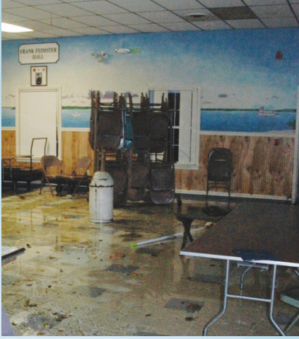
Water damage inside the firehouse.