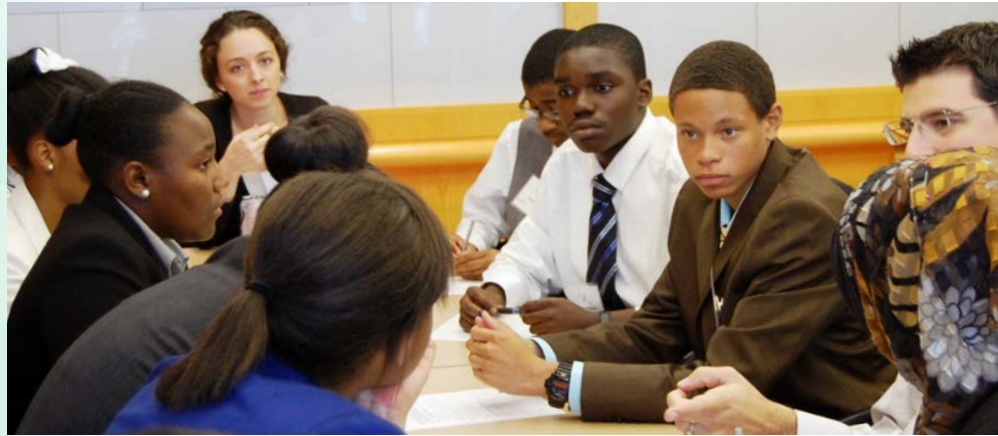
Students meeting with law professionals.

NJ LEEP Inc. (The New Jersey Law Education Empowerment Project) was founded in 2006 in partnership with Seton Hall Law School to empower youth from underserved neighborhoods in northern New Jersey to pursue greater educational achievements through a three-fold focus on skills, habits and exposure. NJ LEEP focuses on combining law-related education programming with college access programming. In 2013, The Provident Bank Foundation donated $5,000 to support year-round programming for students.