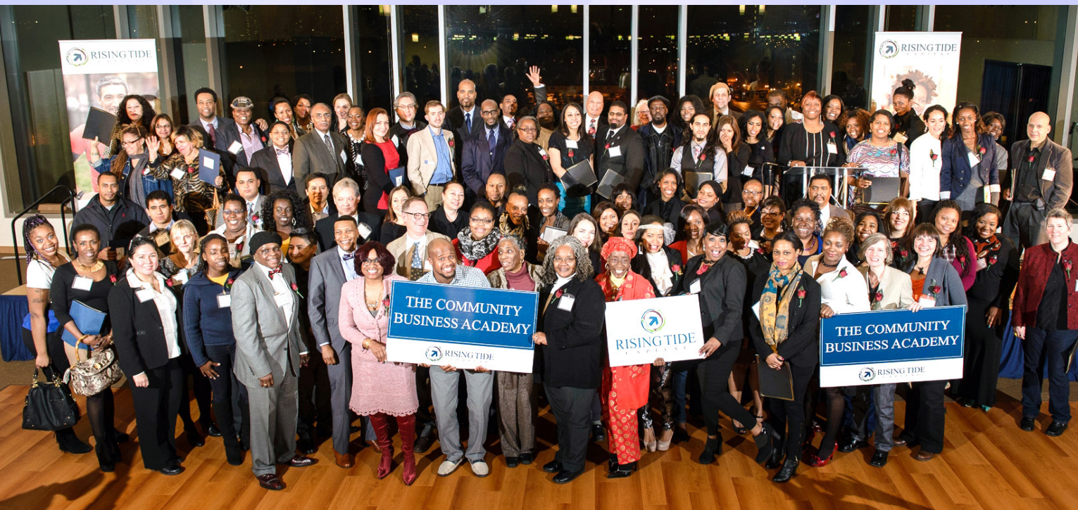
Participants of Rising Tide's year-round, micro-enterprise development programs.