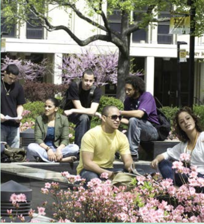
Students relaxing on campus in between classes.