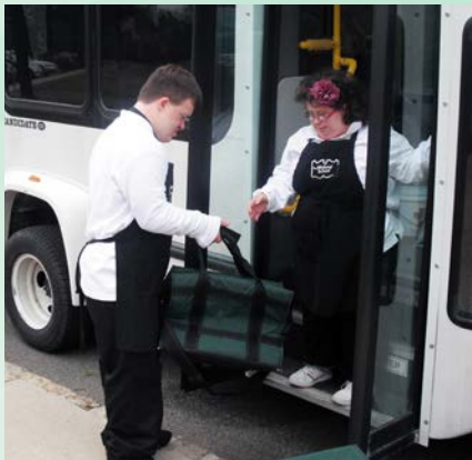
Participants of Midland Adult Services load up the Meals on Wheels truck for deliveries.