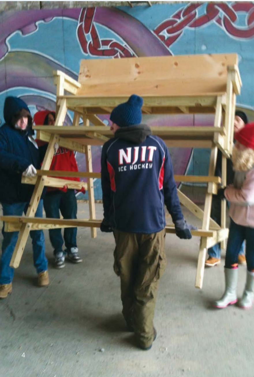
NJIT students moving a lifeguard chair in Asbury Park.