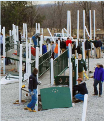
Volunteers constructing the All-Access Playground.