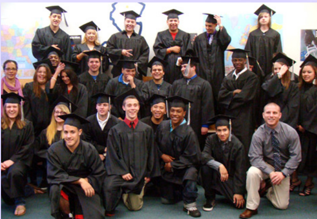
2013 70001 JOBS PLUS Graduates pose for a picture with NewBridge staff members.