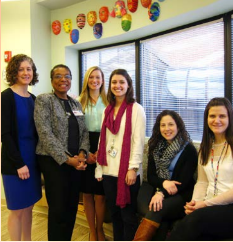
Eating Disorder Program Staff of Overlook Medical Center.